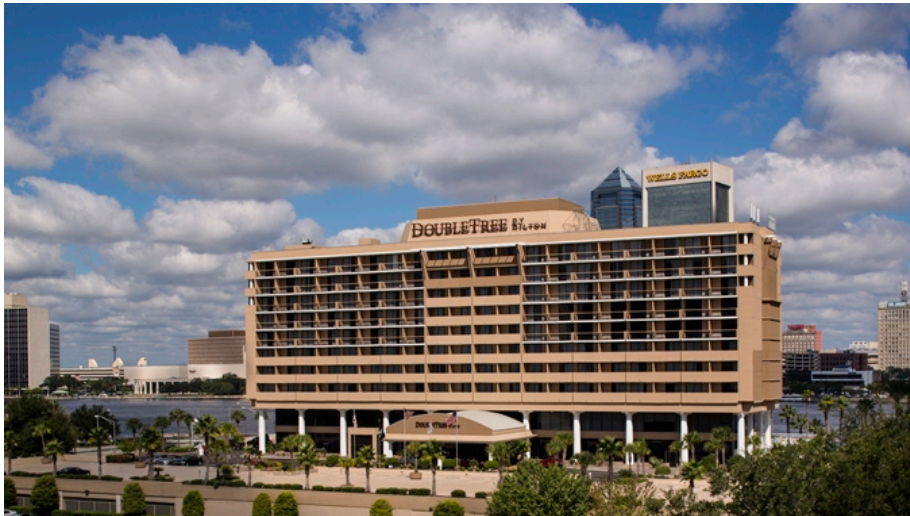
The DoubleTree by Hilton Jacksonville Riverfront